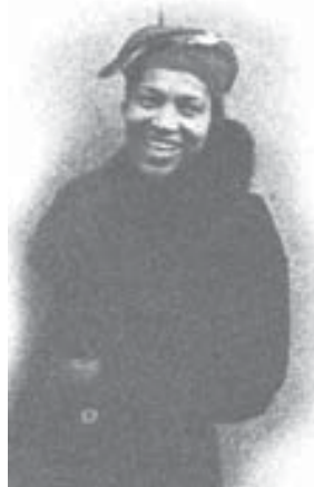
Zora Neale Hurston

I know I walk in and out of several worlds every day. Joy Harjo