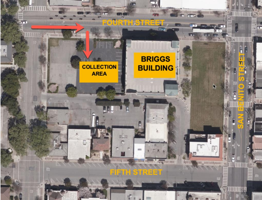
Figure 2: Map to 4th Street Entrance to Parking Lot behind Briggs Building, Hollister