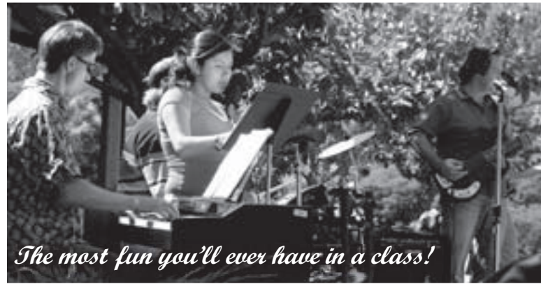
The most fun you'll ever have in a class!